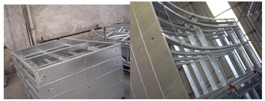
The hardware for the dasher boards: